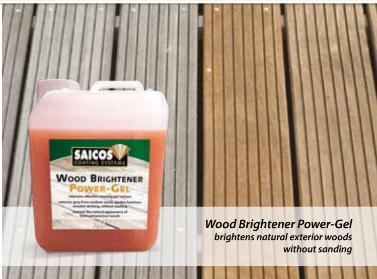
Wood Brightener Power-Gel brightens natural exterior woods without sanding

especially recommended for vertical surfaces